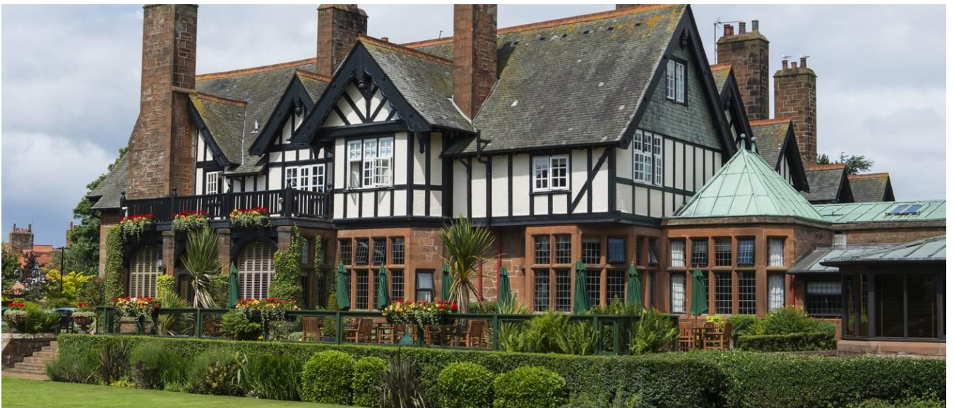
Troon, Ayrshire – Piersland House, Troon